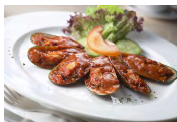
N.Z. SPICY MUSSELS