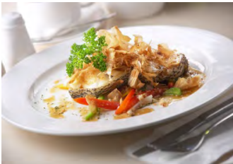
BLACK PEPPER CHICKEN