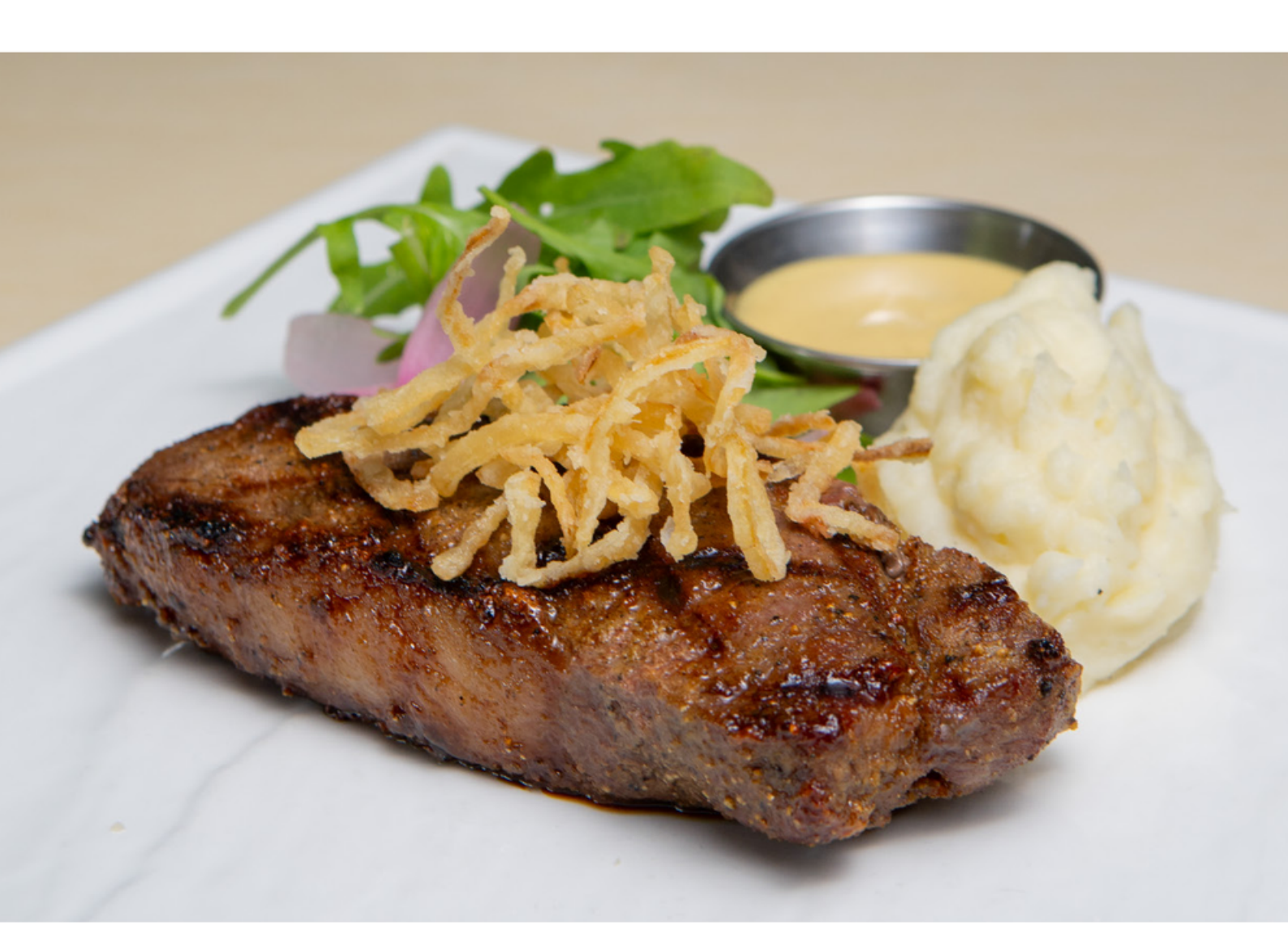
Prices are subject to 10% Service Charge and 6% Service Tax. Management reserves the right to change or cancel this promotion at any time and without prior notice.

Present your name card or corporate ID to enjoy the discount. Applicable for dine-in and normal priced items only.