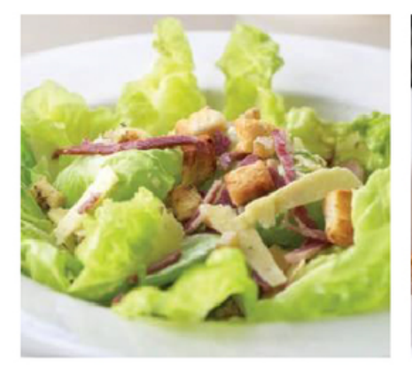
Caesar Salad beef bacon, croutons, walnuts, cheese

Set comes with soup of the day & dessert of the day. Upgrade your soup to salad (Apple & Kale Yoghurt Salad or Orange & Baby Spinach) with RM5<sup>++</sup>