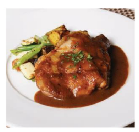
Honey Mustard Chicken served with sauteed vegetables (french bean, cherry tomato, shitake mushroom, green zucchini, carrot), roasted potatoes & honey mustard sauce