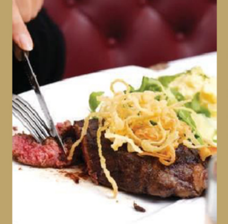
Australian Hereford Grainfed Ribeye

served with fried onio strings &sauteed asparagus RM 86**