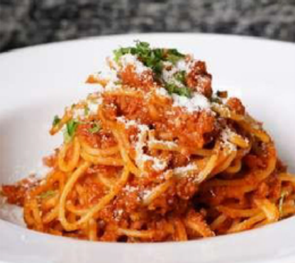
Spaghetti Bolognese (spaghetti beef / chicken) tomato meat sauce